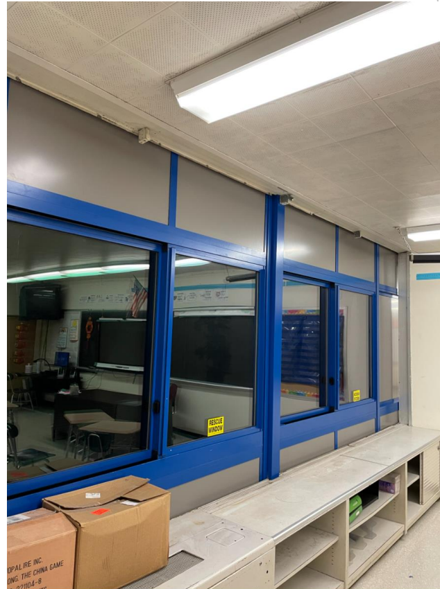
Elevation 19 Window Interior