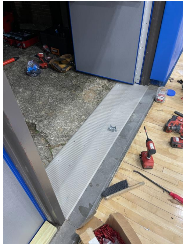
Gymnasium Door Installation