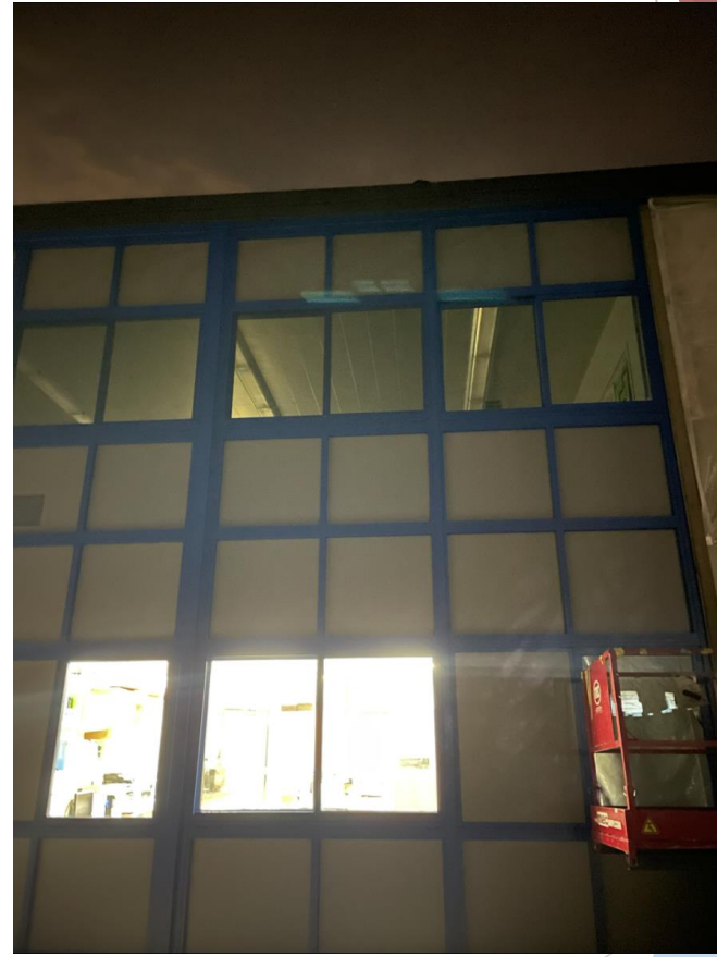
Elevation 19 Window Installation