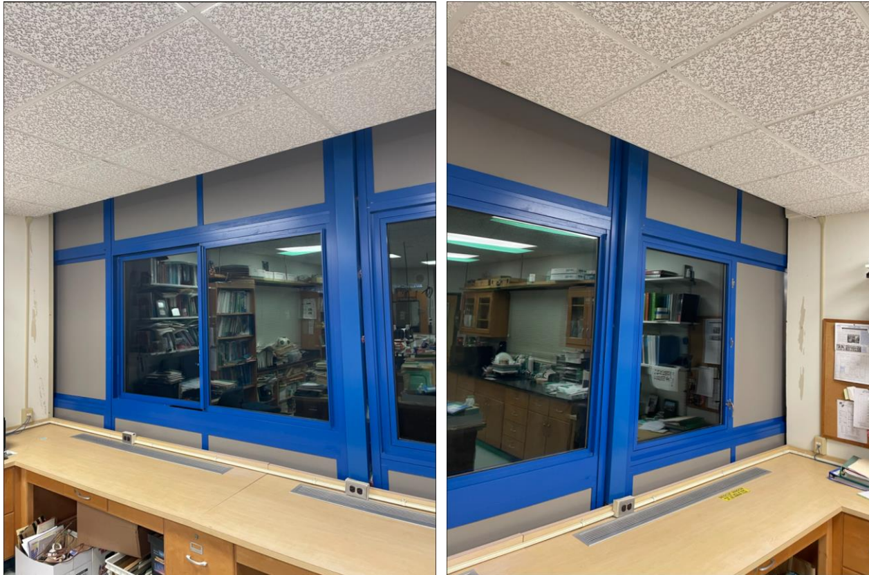
Elevation 19 Window Interior